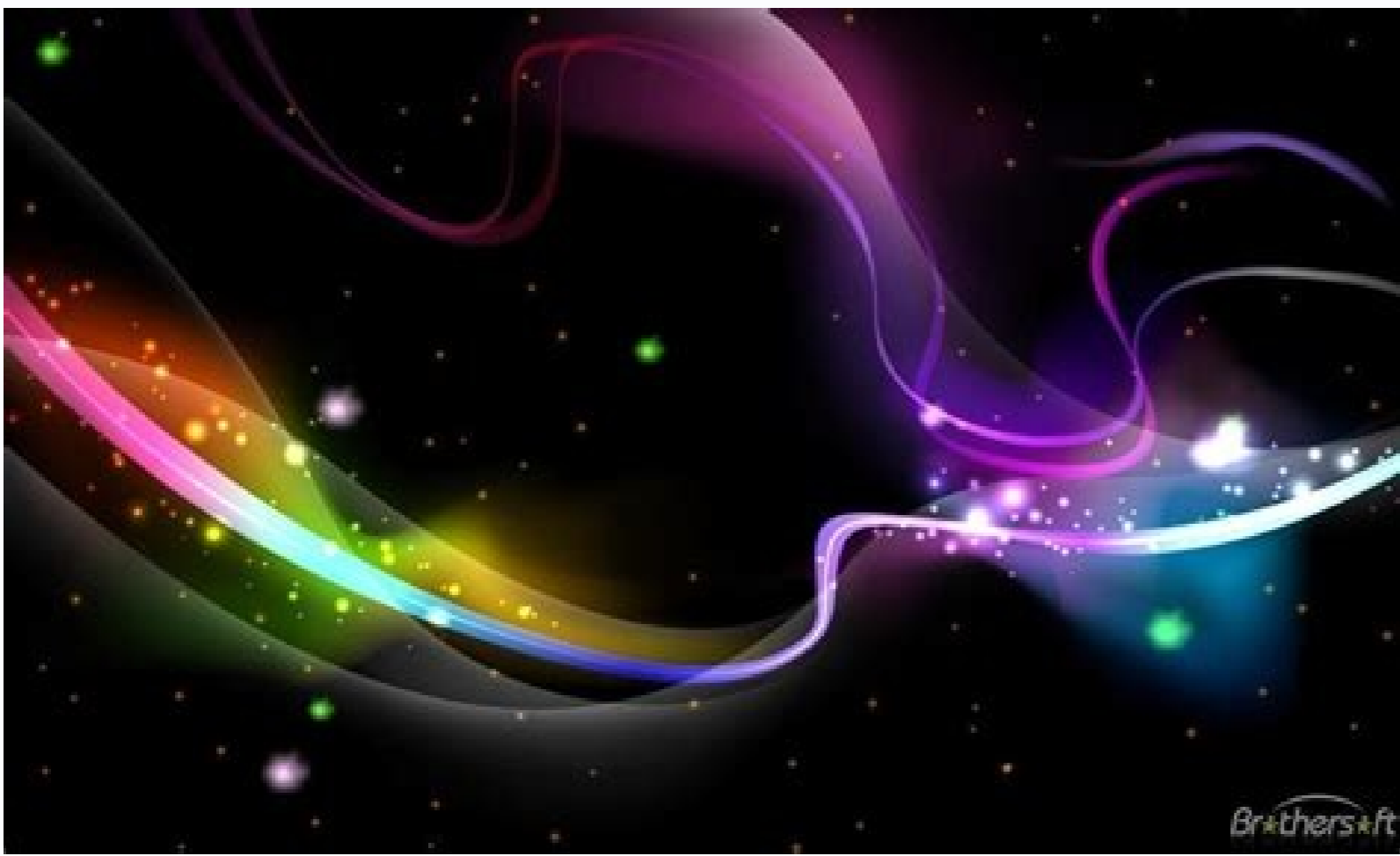
Colors tv download windows 7. Colors tv app download for pc windows 7.